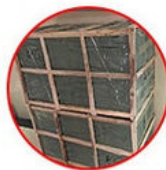
NAIL WOODEN BOX