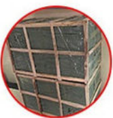
NAIL WOODEN BOX