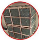
NAIL WOODEN BOX