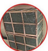
NAIL WOODEN BOX