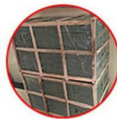
NAIL WOODEN BOX